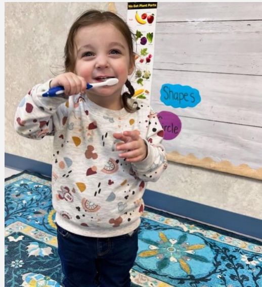
Dental Kits Distributed by MBDDS

President's Message In-person Meetings: April & May April 11 Meeting & CE Pre-Dental Students' Request Member Renewal Deadline Golf Fundraiser Invitation Calendar of Events 2022–2023 Feb. 7 Meeting Minutes . . . and more!